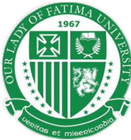
Our Lady of Fatima University - College of Nursing Valenzuela City, Philippines