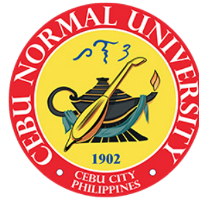
Cebu Normal University - College of Nursing Cebu City, Philippines