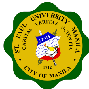
St. Paul University Manila - College of Nursing and Allied Health Sciences Manila, Philippines