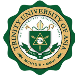
Trinity University of Asia - St. Luke's College of Nursing Quezon City, Philippines