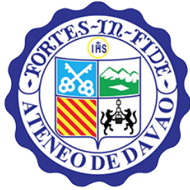
Ateneo de Davao University - School of Nursing Davao City, Philippines